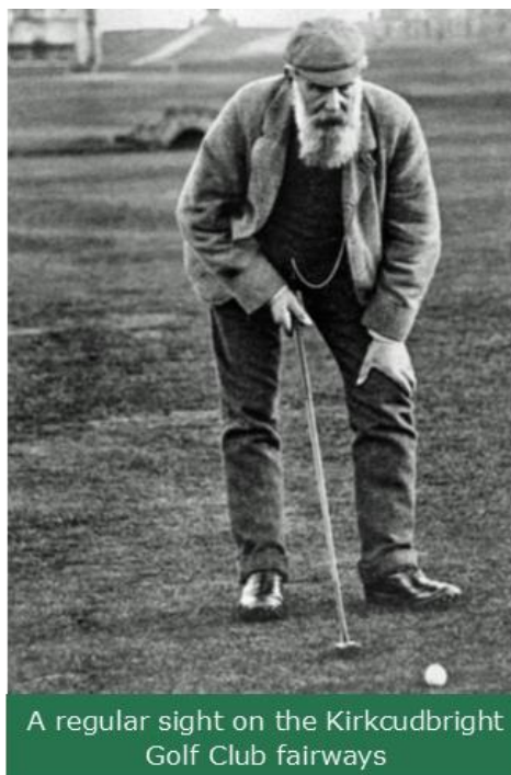
A regular sight on the Kirkcudbright Golf Club fairways