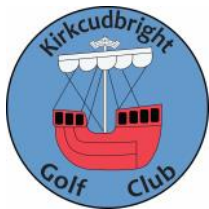
Pin Style Ball Marker

For those who are interested we have some more stock for our golf accessories that are available via the Office. We now have 2 styles of "Kirkcudbright Golf Club" branded ball markers, a resin pin type and a 2-sided enamel/metal coin type. Also, if you have trouble getting a tee into the ground during this winter, we have packs of the rubber "pyramid" tees that sit on the ground. Just ask at the Office for these and the usual range of balls, gloves, tees and so on.