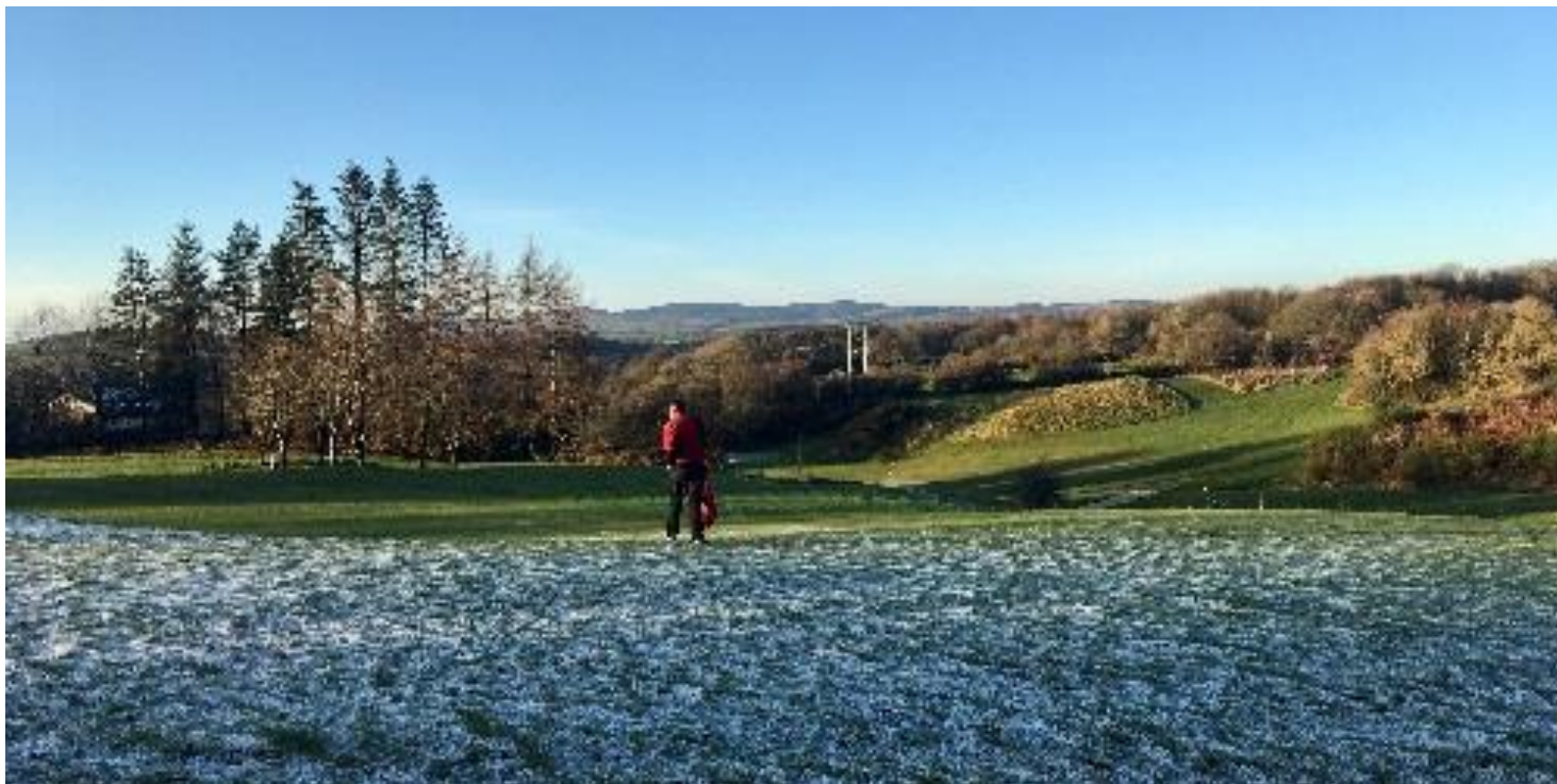
Above : Walking down the 12th fairway overlooking the 9th green and 10th tee. Below : View from the back of the 13th green looking back towards the tee.