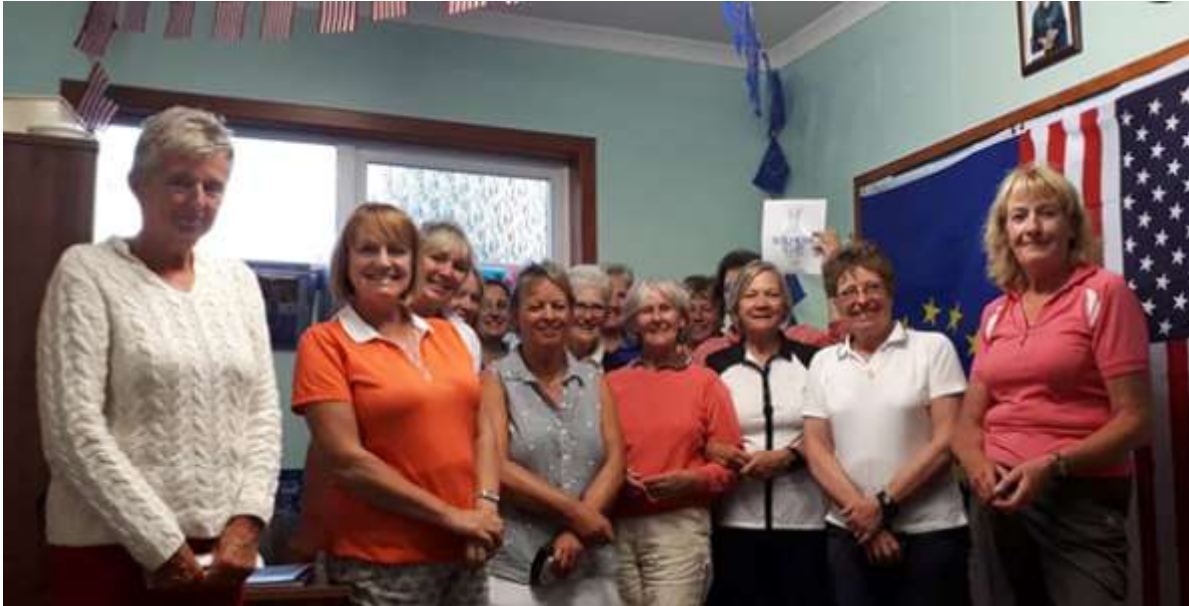
Above, a packed changing room on the day.

16th July was Ladies' Captain's Day using the formats for the Solheim Cup to play a 6/6/6 - Foursomes on the front 6, switching partners for 4BBB in the middle and Singles to return home. This was a new format for the Ladies and we had a great turn out while raising awareness for the big event in September.