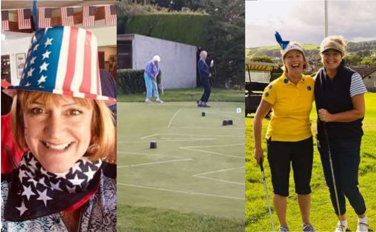
Above, a USA team member, the mini-Gleneagles putting green and 2 Europe team members.